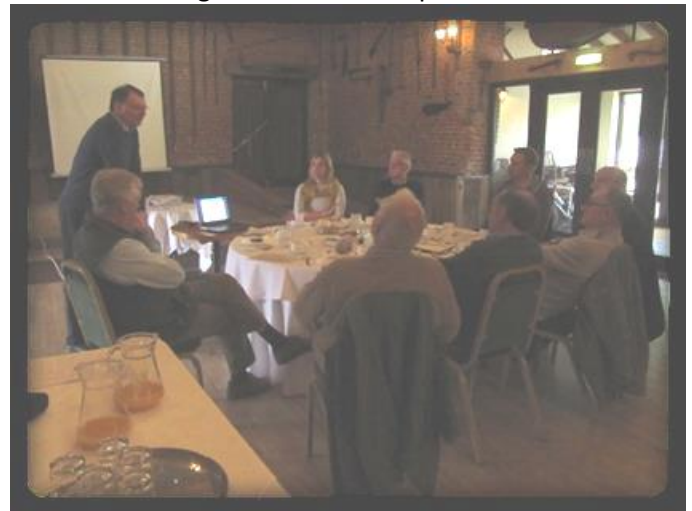
Breakfast Meeting

The last farmer DTC breakfast meeting for 2016 was held in October to provide an update on DTC results and to discuss future agri-environmental policies.