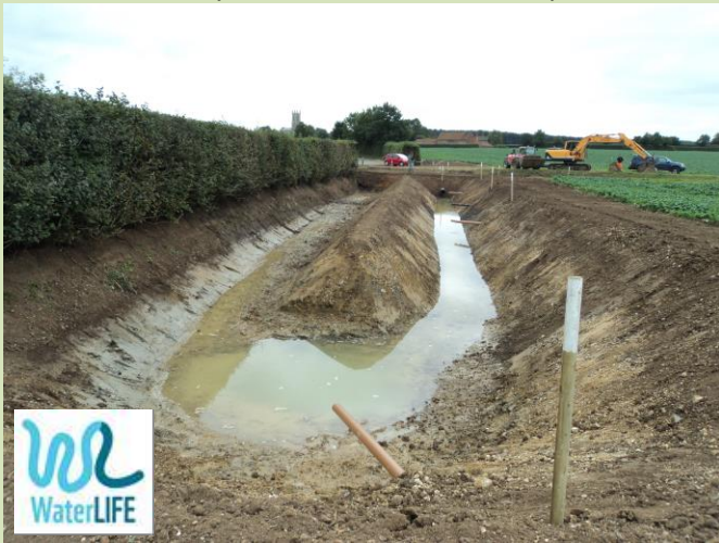
Salle Silt Trap

The Salle Silt Traps were constructed in September.