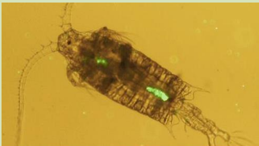
Zooplankton with ingested micro plastics from Cole et al 2013

Every year globally significant flocks of migrant birds, such as plovers, dunlin, godwits and avocets feed in the Breydon Estuary. Attracted by the abundance of invertebrates in the mud, the birds get high calorie food to retain their fat reserves during the winter. Fish also feed on small creatures in Breydon. These invertebrates filter the water for food particles and inadvertently take in plastic fibres.