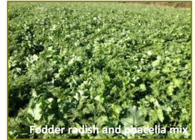
Fodder radish and phacelia mix

Cover crops also reduce surface run-off from fields left fallow and ensure that essential soil and nutrients are retained on your land. Furthermore, some cover crops can help weed control and add nitrogen. For more information or further details about which mixtures to use, please contact Teresa on the numbers above or Nick Green, HAM, on 07798 701064.